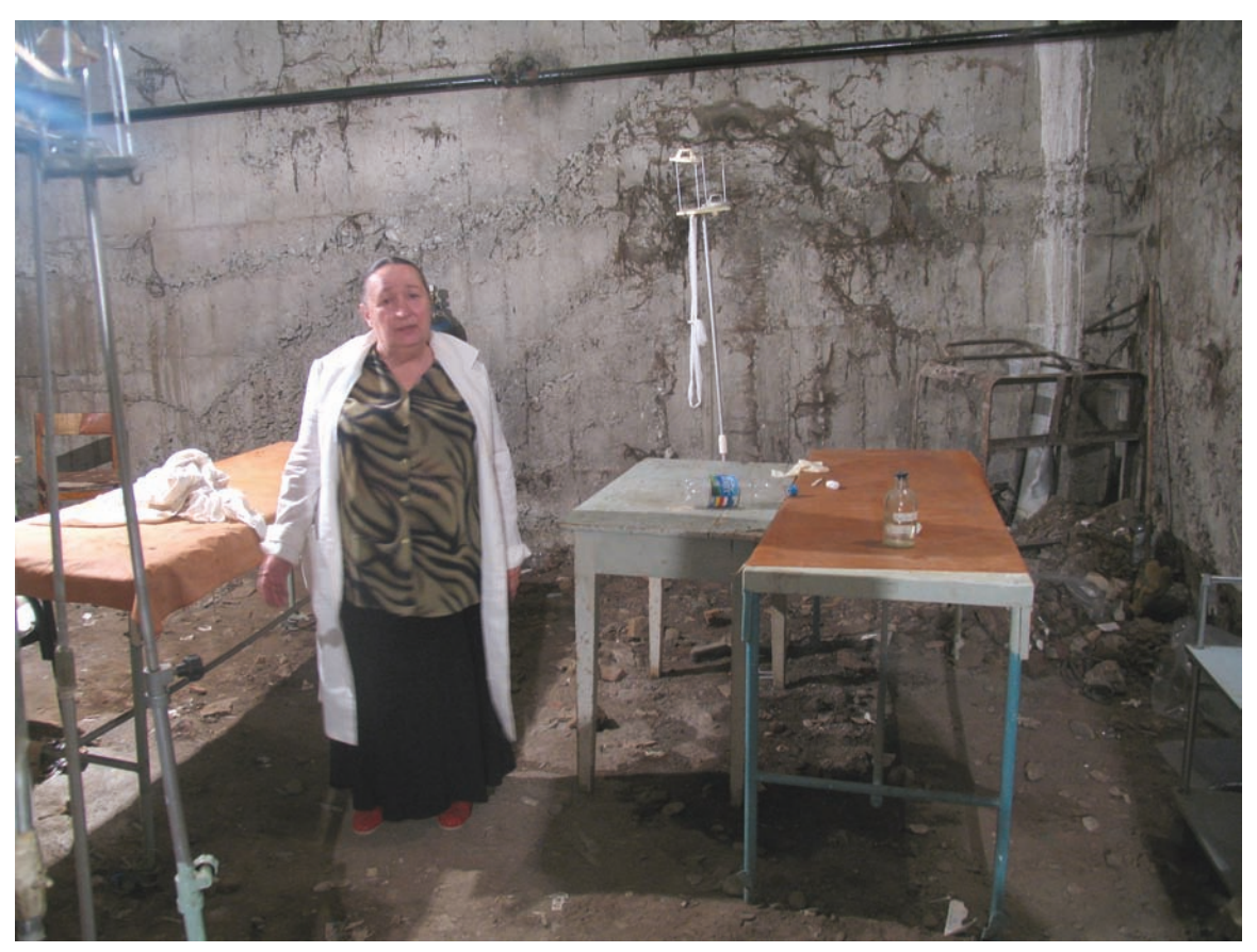
A doctor in the basement of the Tskhinvali hospital where, despite poor lighting and inadequate equipment, medical personnel managed to save, during the fighting, all 273 of their wounded patients.

Hospitals enjoy a status of special protection under humanitarian law beyond their immunity as civilian objects, and the presence of wounded combatants there does not turn them into legitimate targets.<sup>125</sup>