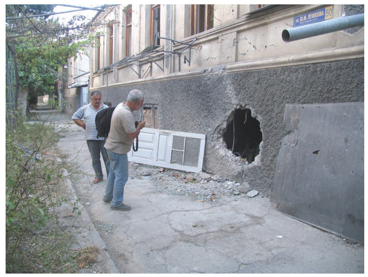
Human Rights Watch examining the basement of an apartment building on Luzhkov Street, in Tskhinvali, which was hit by Georgian tank fire.

Human Rights Watch researchers saw multiple apartment buildings in Tskhinvali hit by tank fire. In some cases, it was clear that the tanks and infantry fighting vehicles fired at close range into basements of buildings. Human Rights Watch interviewed several people who were sheltering in these basements at the time of the attack.