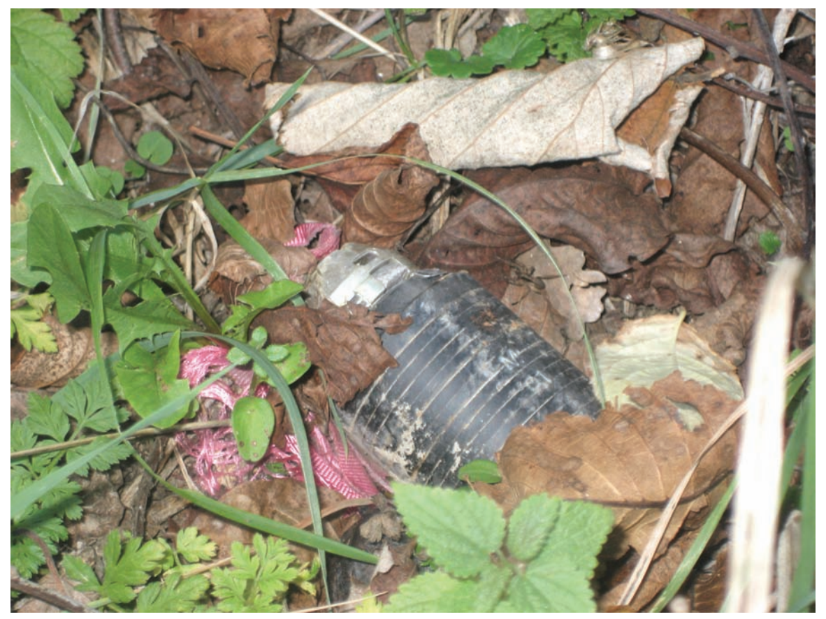
An unexploded M85, an anti-personnel and anti-armor submunition found in Shindisi in October 2008. M85s caused civilian deaths and injuries in Shindisi both at the time of attack and afterwards. Bought from Israel and launched by Georgia, this submunition is carried in an Mk-4 160 mm rocket.

which they brought back to the village. When they tried to disassemble it the submunition exploded, killing Ramaz Arabashvili, age around 40, and wounding four others. 182