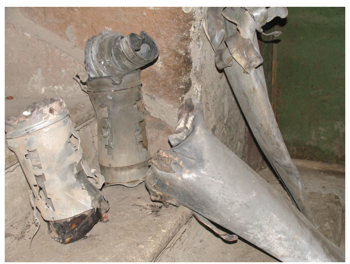
Components of BM-21 Grad rockets recovered in an apartment building in Tskhinvali.

The above are only a few of the examples of damage caused to the South Ossetian capital by Grad attacks.