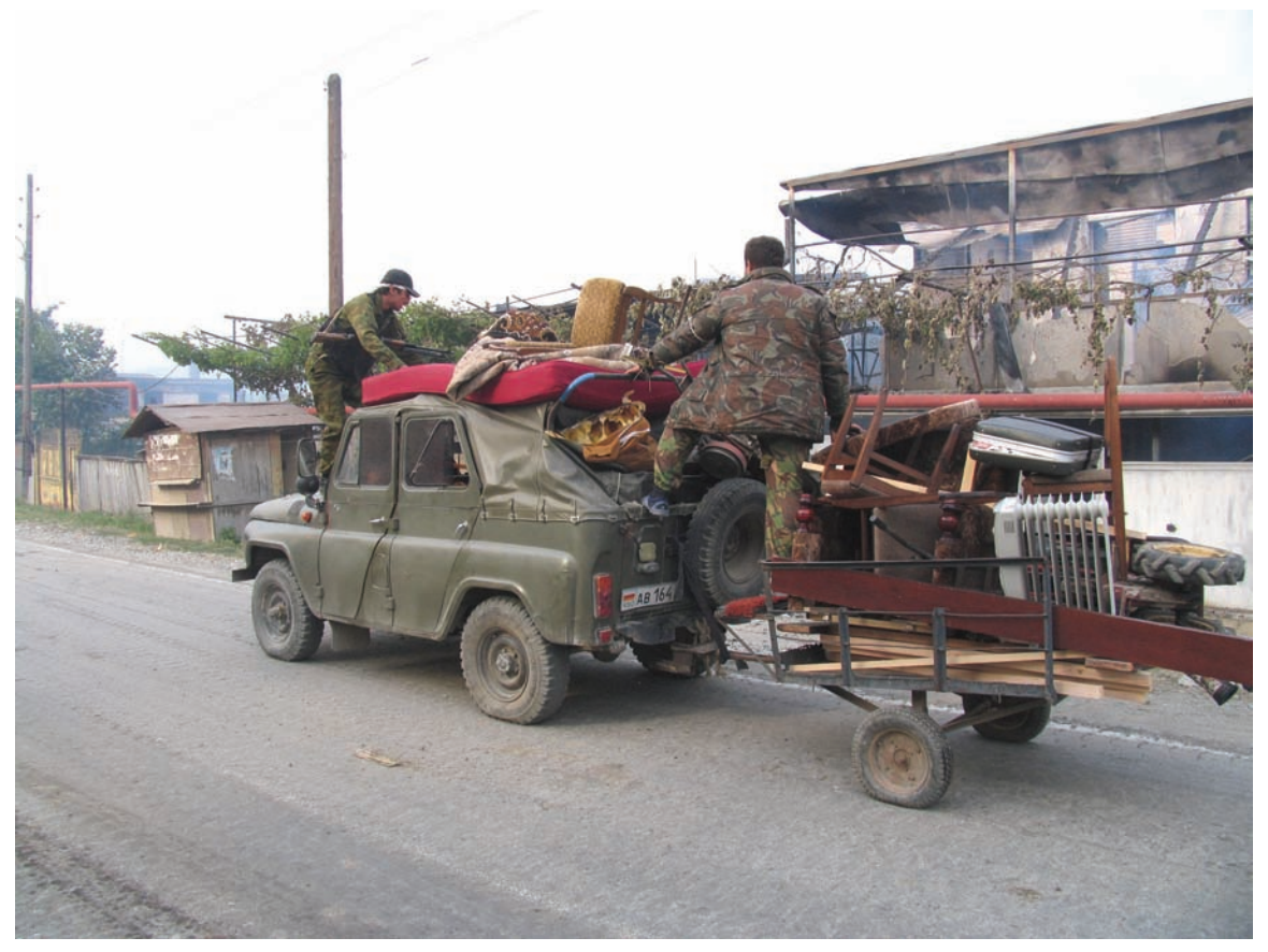
Armed looters take household items from the ethnic Georgian village of Kvemo Achabeti.

On August 12, Human Rights Watch researchers traveling on the TransCam road from Java to Tskhinvali witnessed terrifying scenes of destruction in Kekhvi, Kurta, Zemo Achabeti, Kvemo Achabeti, and Tamarasheni. Dozens of houses had been freshly burned down and remnants of houses and household items were still smoldering. Many other houses were aflame and appeared to have been just torched. Human Rights Watch also saw and photographed Ossetian militias as they moved along the road next to Russian tanks and armored personnel carriers, entered the houses that remained intact, and loaded furniture, rugs, televisions, and other valuables onto their vehicles. Attempting to justify the looters' actions, an Ossetian man traveling on the same road told Human Rights Watch, "Of course, they are entitled to take things from Georgians now—because they lost their own property in Tskhinvali and other places." 362