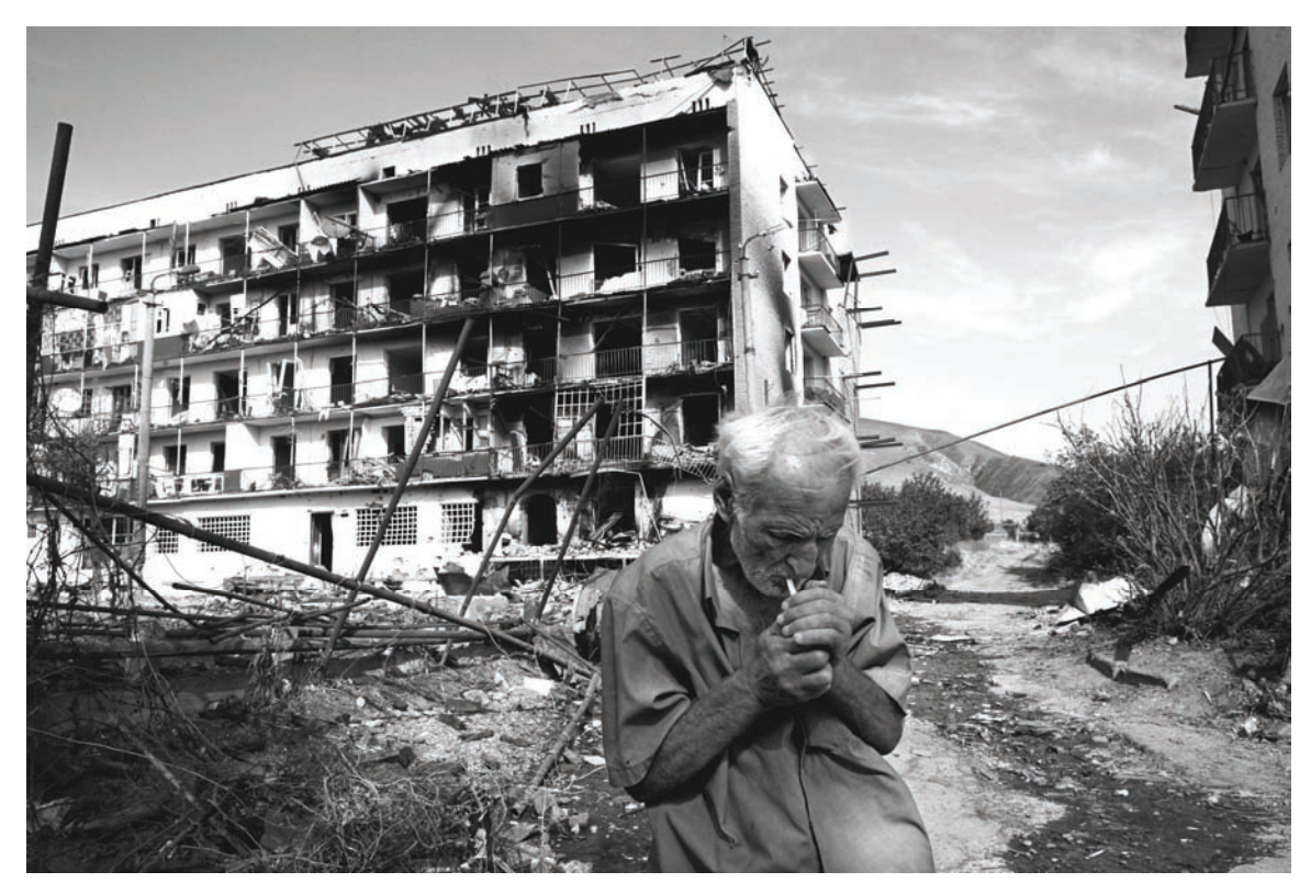
A man stands in front of an apartment building on Sukhishvili Street in Gori, bombed by Russian forces prior to their advance into Gori district.

In some cases in South Ossetia, civilian casualties and damage to civilian property in Georgian villages were caused by artillery shelling. Because both Russian and South Ossetian forces possessed artillery capacity, Human Rights Watch was not always able to establish with certainty whether responsibility for indiscriminate artillery attacks lay with Russian or South Ossetian forces. In these cases further investigation is required to determine specific responsibility for violations of international humanitarian law.